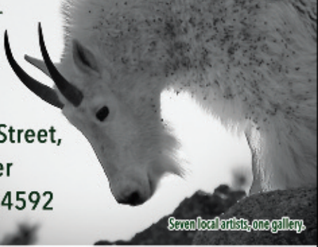
Seven local artists, one gallery.

A GALLERY OF GIFTS AWAITS! Open All Year!